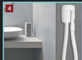
The WallyFlex : the ideal tool for a quick clean.