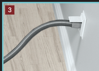
The vacuum inlets are strategically placed.