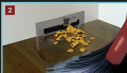
The automatic dustpan is a must for the kitchen.

What's handier than a hose that automatically stores itself?